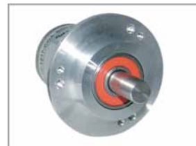
Absolute encoder WDGA58B