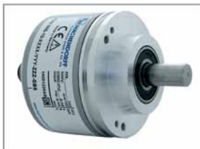
Incremental encoder WDG158B

Put together your own measuring unit for shaft copying, by selecting an encoder and specifying the length of the special belt.