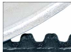
Special belt for exceptionally quiet, non-slip measuring.