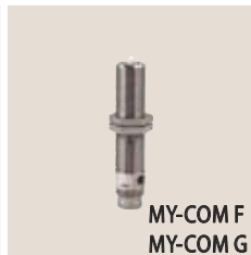
MY-COM F MY-COM G