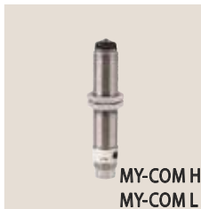
MY-COM H MY-COM L